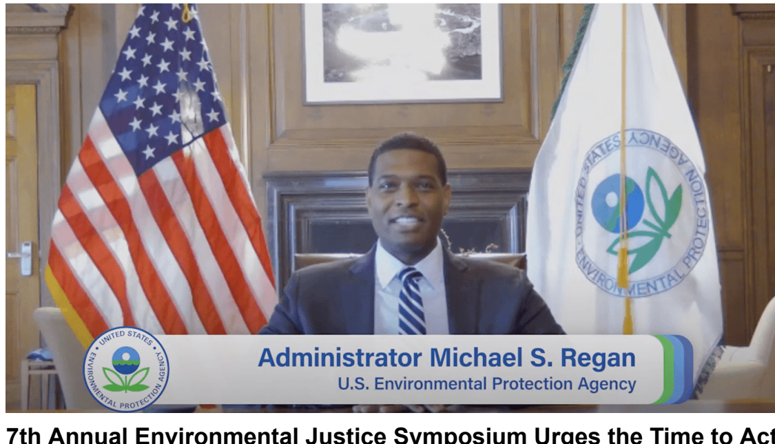
Administrator Michael S. Regan U.S. Environmental Protection Agency