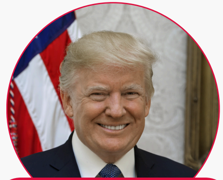
DONALD J. TRUMP

Supports expanding and strengthening the Affordable Care Act (ACA). 2