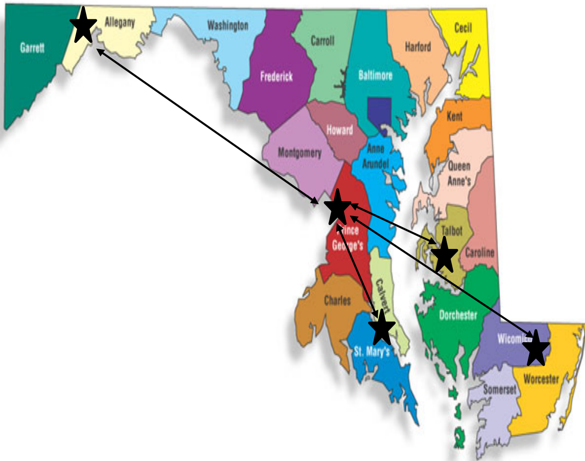
Figure 1: Health Care Reform Forum Locations in Maryland