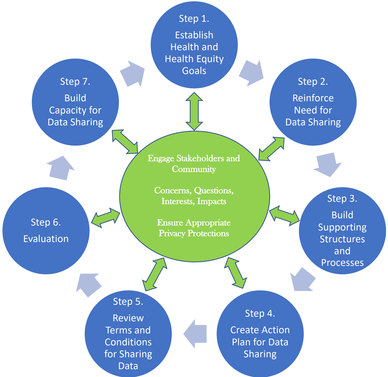
Figure 1: Process to Facilitate Data Sharing within a Health in All Policies Framework